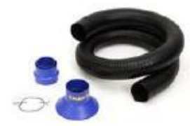
C1572 Duct Kit