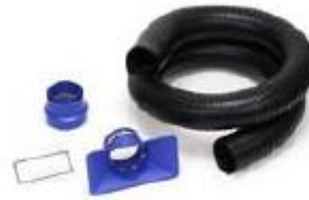
C1571 Duct Kit